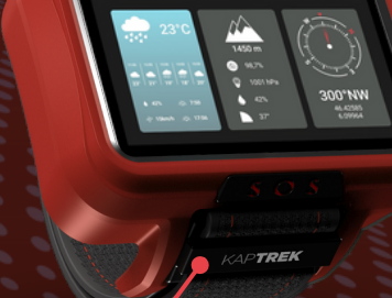
Metallic wristband buckle